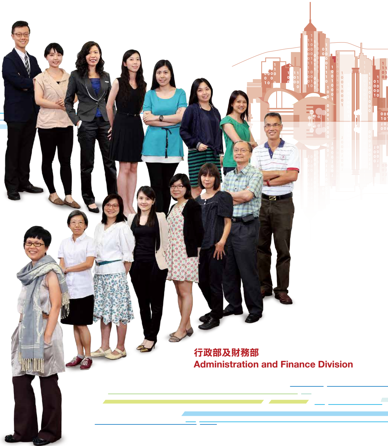
行政部及財務部 Administration and Finance Division