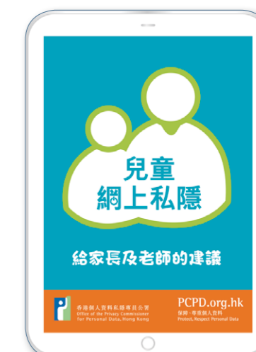
單張：兒童網上私隱——給家長及老師的建議 Leaflet: Children Online Privacy – Practical Tips for Parents and Teachers