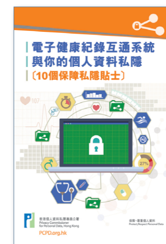
單張：電子健康紀錄互通系統與你的個人資料私隱 (10個保障私隱貼士) Leaflet: Electronic Health Record Sharing System and Your Personal Data Privacy (10 Privacy Protection Tips)