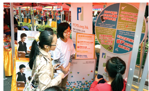
攤位的互動飛鏢遊戲闡釋一些常見的網上私隱陷阱。 The booth featured a game of darts which explained some common privacy traps online.

公署參與了中西區區議會於2015年12月13及20日兩個周末舉辦的上環假日行人坊，活動吸引了約4,000名市民參觀公署攤位。