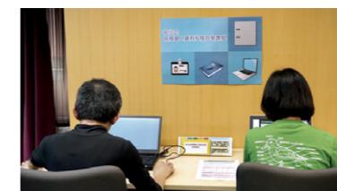
參加者在講座中即場體驗網上自學課程。 Participants experienced the online self-assessment tool at the seminar.