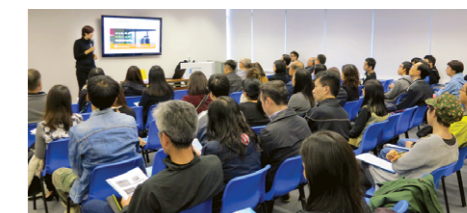
公署與工業貿易署合辦講座，為中小企介紹這網上自學課程讓他們了解符合條例的規定。 The PCPD in collaboration with the Trade and Industry Department held an introductory briefing on this online training module to enhance SMEs' knowledge on the compliance with the Ordinance.