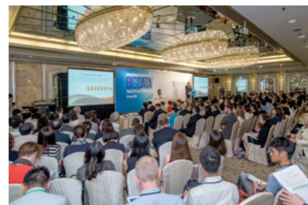
會議全場滿座吸引250名參加者。 The Conference was a full house attracting 250 participants

為探討大數據應用而引申的不同私隱議題，公署於2015年6月10日舉辦「從私隱角度探討大數據國際會議」，吸引了250名本地及海外的保障資料私隱人員、資訊科技專業人士、法律專家及商界領袖出席。