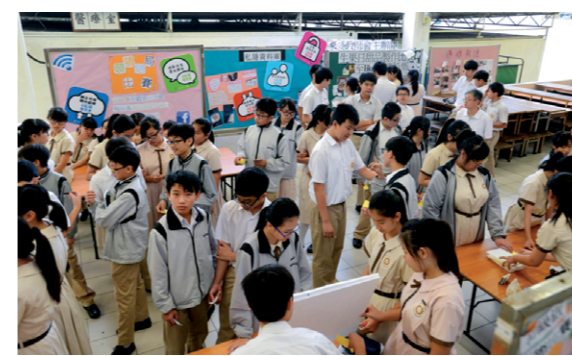
「保障私隱學生大使計劃2015暨中學生『私隱檔案』新聞攝製比賽」入圍隊伍透過其得獎作品及不同形式活動，於校園宣傳私隱保障。 The finalists of the Student Ambassador for Privacy Protection Programme 2015 - TV News Feature on a Personal Data Protection Competition promoted privacy protection through their work and various activities on their campuses.