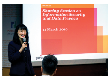
羅兵咸永道會計師事務所分享與資訊保安及資料私隱有關的議題。 Representative of PwC shared their views on information security and data privacy.