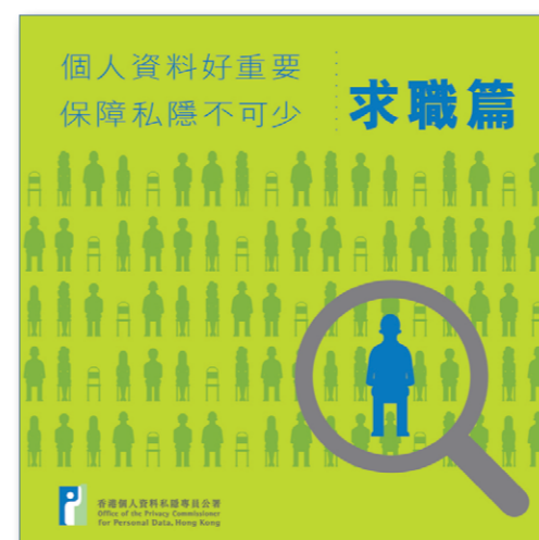
單張：個人資料好重要保障私隱不可少——求職篇 Leaflet: Personal Data is Essential – Protect Your Privacy – Job Seeking