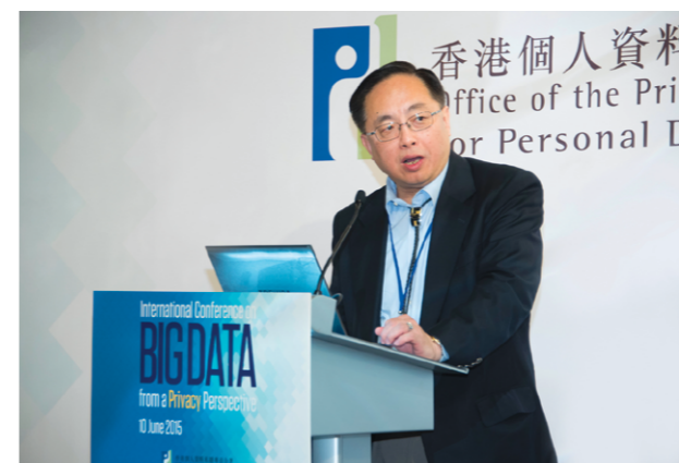
楊偉雄先生蒞臨主禮。 The Hon Nicholas W Yang officiated at the opening of the Conference.