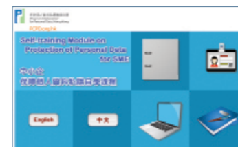
中小企保障個人資料私隱自學課程。 Self-training Module on Protection of Personal Data for SMEs.

meet the needs of SMEs. The PCPD also collaborated with the Trade and Industry Department, SME One of the Hong Kong Productivity Council, the SME Centre of the Hong Kong Trade Development Council, and others to organise these seminars.