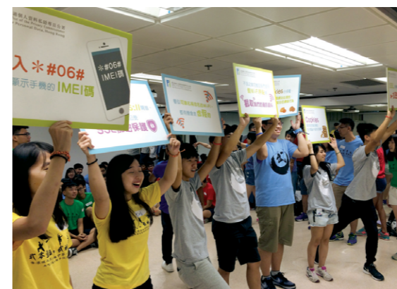
公署首次於大學迎新營舉辦互動遊戲，向大學新生宣揚保障個人資料。 The PCPD held game sessions in orientation camps for the first time to promote data protection to freshmen.

此外，公署為大學教職員舉行度身訂造的培訓講座，講解在條例下，他們作為資料使用者在行政及資訊管理使用個人資料時負上的責任。整個活動共有約40,000名大學生及教職員參加。