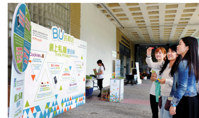
公署的攤位遊戲巡迴了十間大學，提醒大學生「網上私隱要自保」。 The PCPD toured 10 universities with an interactive game booth to remind students to "Be Smart Online".

In addition, the PCPD organised tailor-made seminars to explain to university staff their obligations as a data user under the Ordinance in the areas of administration and IT management. About 40,000 students and staff members participated in the campaign.