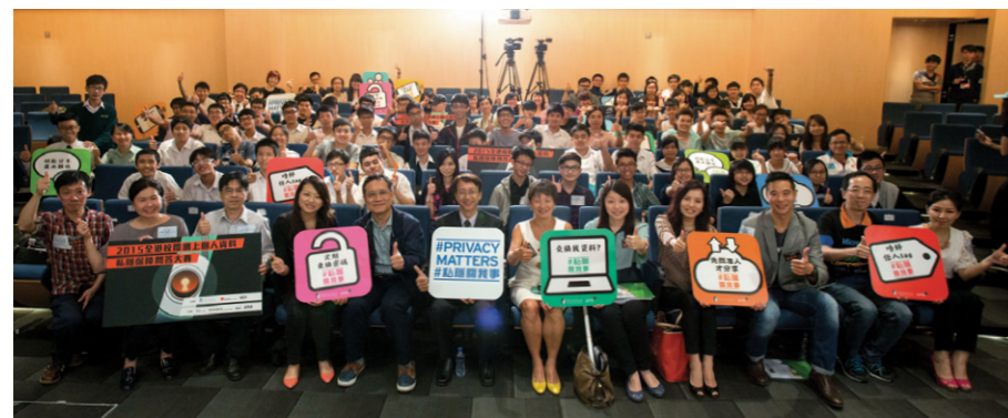
香港個人資料私隱專員公署、香港青年協會、資訊科技教育領袖協會、教育局、政府資訊科技總監辦公室、互聯網協會及Facebook派代表擔任評判，與最後十強學校出席於「關注私隱運動2015」期間舉行的決賽。 Judges from the PCPD, M21, Association of I.T. Leaders in Education, Education Bureau, OGCIO, Internet Society Hong Kong and Facebook attended the final of the quiz with students from the 10 finalists in PAW2015.

此外，「保障私隱學生大使計劃2015」首次舉行全港校際網上個人資料私隱保障問答大賽。活動由公署及香港青年協會賽馬會Media 21媒體空間合辦，並於5月9日舉行了決賽。經過一輪激戰後，最終由樂善堂梁銶琚書院、趙聿修紀念中學及喇沙書院分別奪得冠、亞、季軍。