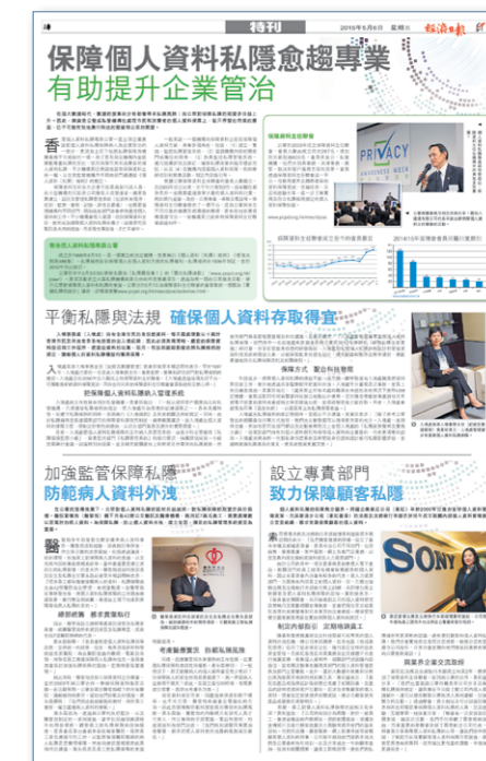
經濟日報出版特刊，表揚保障資料主任聯會會員致力保障個人資料私隱。 The Hong Kong Economic Times published a special supplement to recognise the effort made by DPOC members in the protection of personal data privacy.