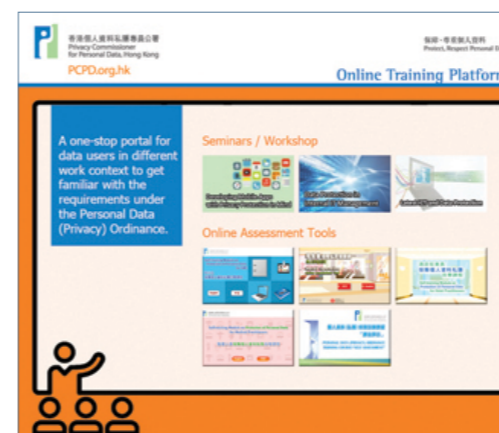
一站式平台方便從事不同工作的資料使用者熟悉條例的要求。 A one-stop portal for data users in different work context to get familiar with the requirements under the Ordinance.

Representatives from the co-organisers and the PCPD formed a working group to canvass the privacy concerns among the practitioners. In response to the suggestion raised by the working group, the PCPD has developed the "Online Training Platform" to provide a convenient channel for those practitioners who wish to go through the requirements of the Ordinance online.