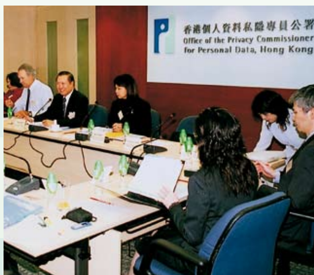
第二十六屆亞太區私隱機構論壇的開會情況。 Snapshots of the 26th APPA Forum.