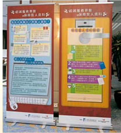
酒店業保障私隱活動中的私隱保障日及研討會。 Privacy Days and Seminars of the Hotel Privacy Campaign.