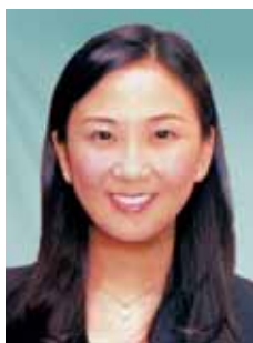
葛珮帆 女士 Ms. Elizabeth Quat 互聯網專業協會創辦人及主席 Co-founder and President, Internet Professional Association