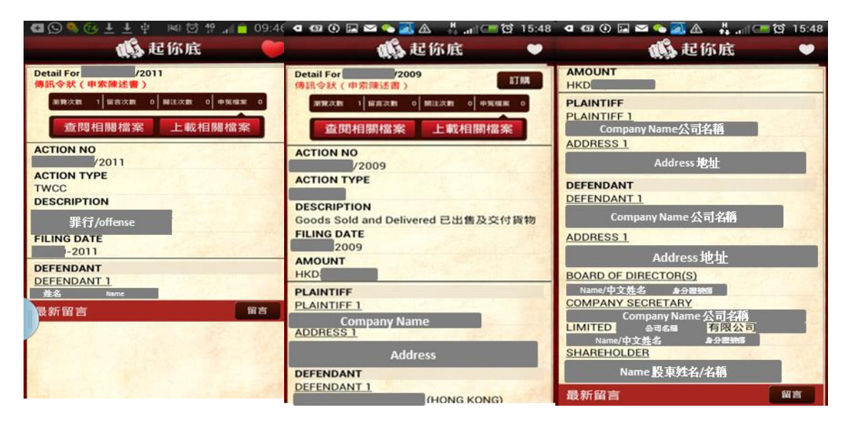
(Fig. 5) (Fig. 6)