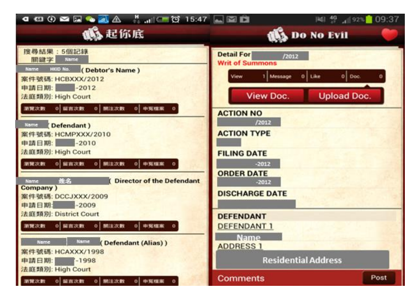
(Remarks: Personal data of the complainant was masked in Figs. 1-6)

18. This Office noted that if the English name of the target person is entered, e.g. CHAN TAI MAN, the litigation data relating to persons with this English name, and transliterated Chinese names in different Chinese characters with similar pronunciation and also names with characters in a different order, e.g. CHAN MAN TAI will be shown. Users could hardly tell the target person from the others.